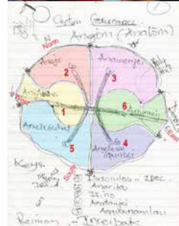
◆ FROM TOP RIGHT JOEL, NATIVE DRESS; FISHING IN ANELCAUHAT BAY; A BEACH WALK; NERIAM'S SKETCH OF THE GOVERNMENT SYSTEM; GLOBE WITH THE ANEITYUM GOVERNMENT SYSTEM; PRIMARY SCHOOL CLASS.